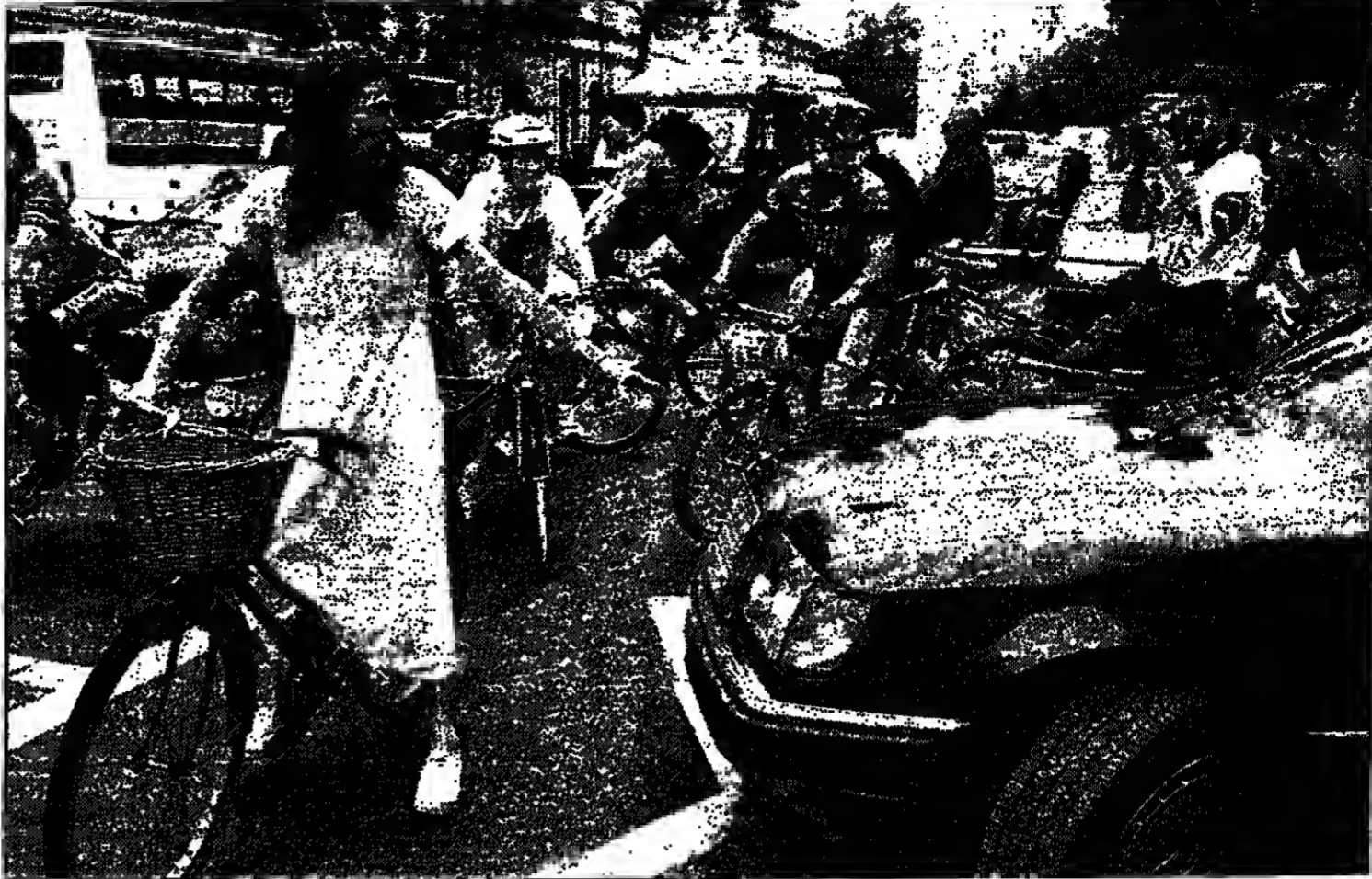
A cyclist argues with a driver on Whitehall as hundreds of anti-car campaigners added to the chaos on the streets of London during yesterday's Underground strike.

troops yesterday afternoon, but it stopped on the outskirts. The attack came after the collapse of a May peace agreement and amid a continuing Russian offensive in the southern mountains. It also came just days before President Boris Yeltsin's inauguration in Moscow tomorrow for a second term. The rebel offensive is the largest since the May peace agreement. Russian forces were also fighting yesterday to recapture parts of Argun, 15 km east of Grozny, which the rebels also attacked on Tuesday. Russian military officials said the situation around Gudermes, Chechnya's second largest city 30 km east of Grozny, was quiet yesterday after reports of clashes the day before. The rebels said the attack was led by their most prominent field commander, Shamil Basayev, Russian news reports said. The separatist attack was reminiscent of one in March, which targeted similar facilities and left scores dead. It took Russian troops several days then to reclaim control of the city. Such attacks on Grozny, the heart of Russia's military and political presence in Chechnya, are demoralizing for Russian troops fighting an unpopular war. (AP)